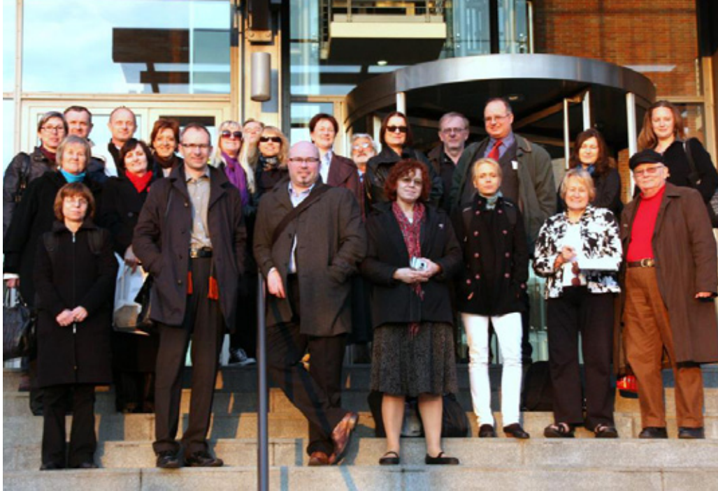
EUSTORY competition organisers at the General Assembly in Hamburg, Germany